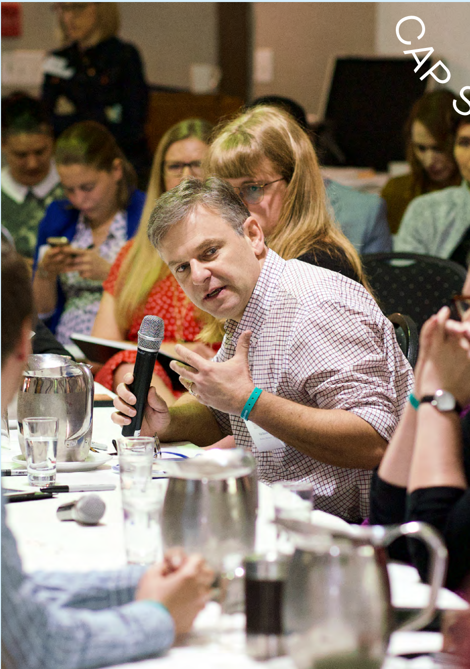
2019 Community Retreat, Orford, QC.