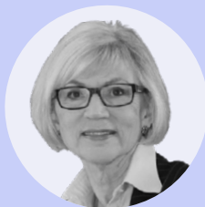
The Right Honourable Beverley McLachlin 2020 Mentor