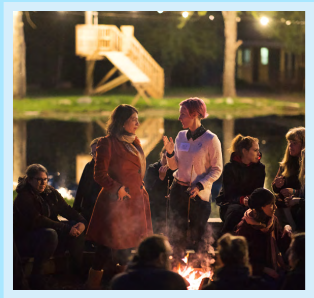
2019 Community Retreat in Orford, QC.