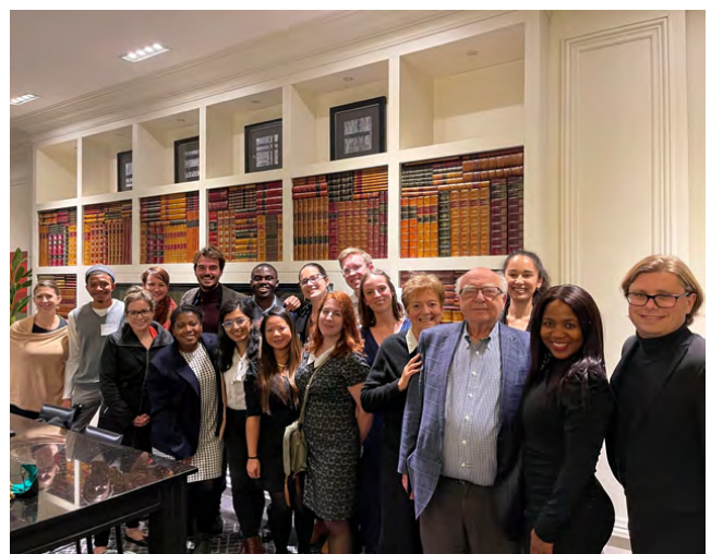
2021 cohort in Quebec City, QC.