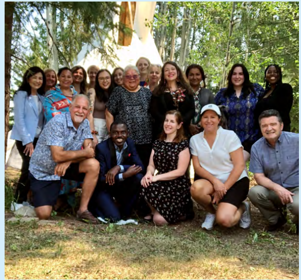
A Space for Healing, Reflection, and Reconciliation, Edmonton, AB, July 2021