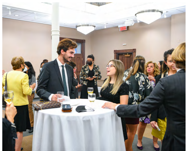
Members of the 2021 cohort in Quebec City, QC.