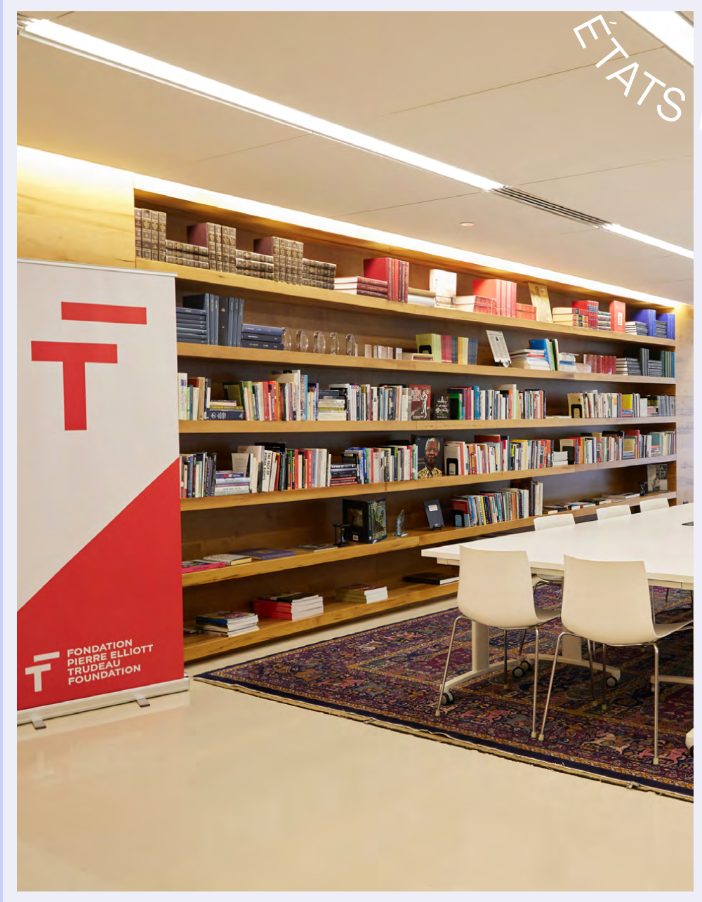
Offices of the Foundation, Montreal, QC.