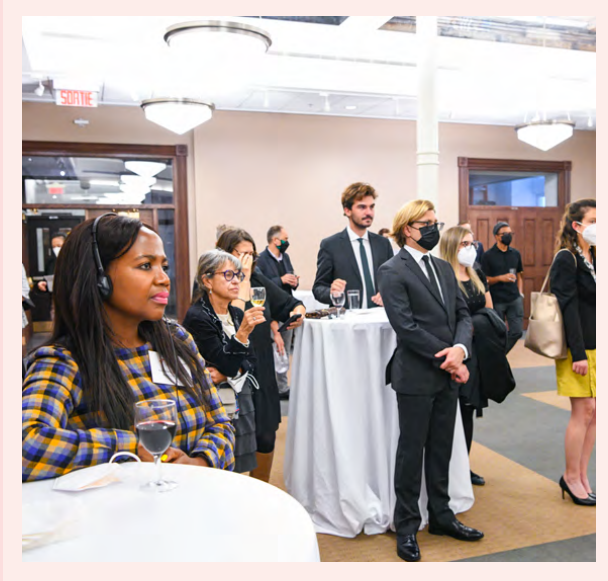
Members of the 2021 cohort in Quebec City, QC.