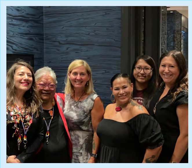
A Space for Healing, Reflection, and Reconciliation, Edmonton, AB, July 2021.