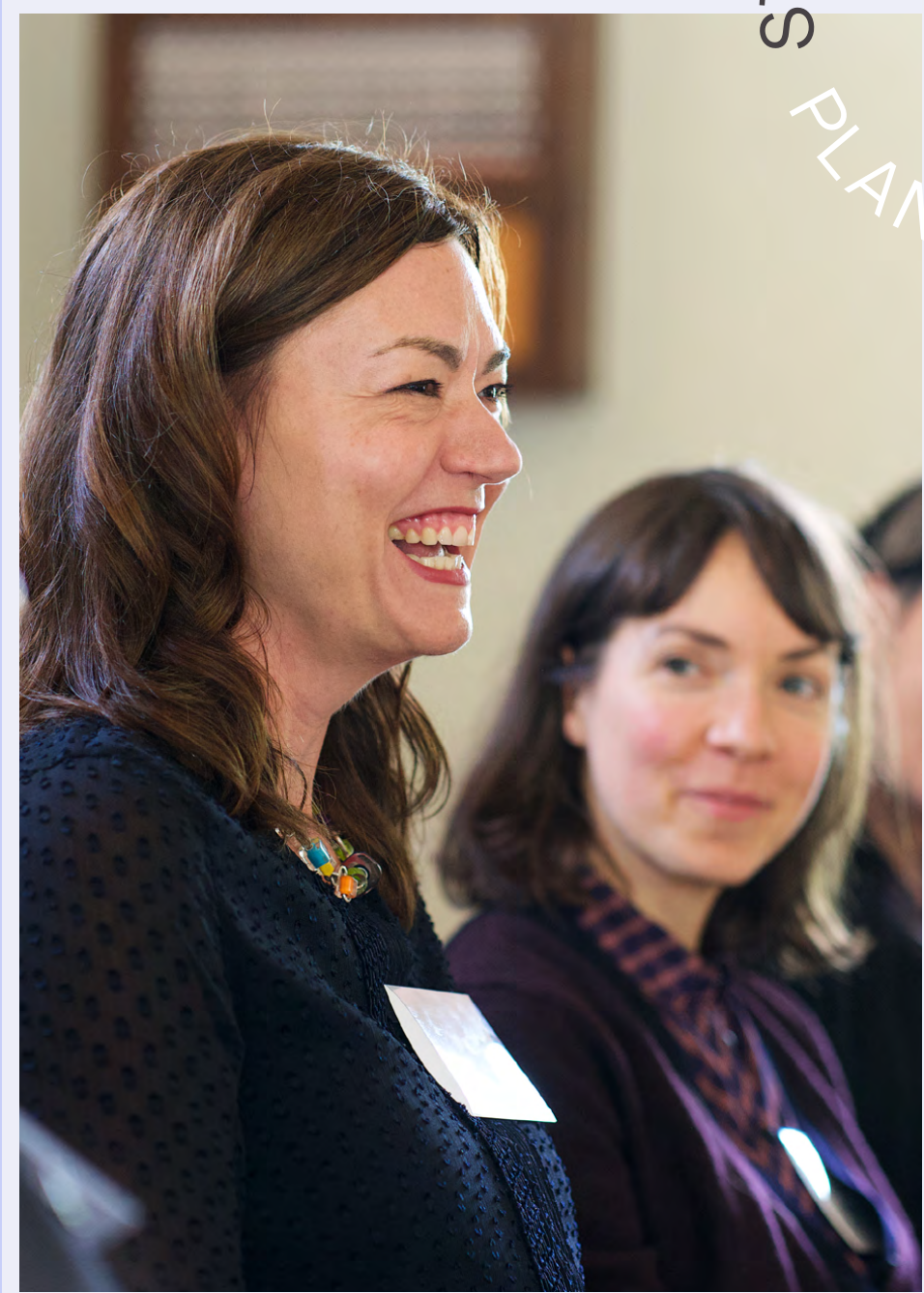
Members of the 2019 cohort in Yellowknife, NWT, in 2019.