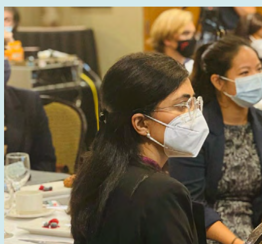
2021 Scholars, Quebec City, QC.

Nevertheless, the Foundation's COVID-19 Impact Committee continued its important work to engage and educate the public on the implications of the pandemic in light of the Foundation's Four Themes. By creating the COVID-19 Impact Committee in spring 2020, the Foundation sought to elevate the voices of our community's experts in public discourse.