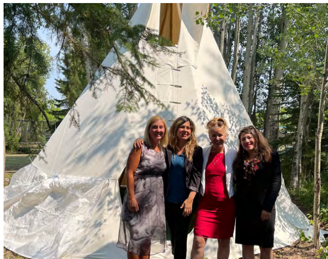
Scholars and alumni, A Space for Healing, Reflection, and Reconciliation, Edmonton, AB, July 2021.