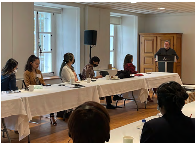
Members of the 2021 cohort in Quebec City, QC.

Our Fellowship program invites academic experts who are recognized for their research and teaching excellence, a strong commitment to sharing knowledge beyond the classroom, strong academic mentoring skills and their innovative approaches when it comes to understanding important issues facing society. Fellows are also invited based on the relevance of their work, knowledge, and experiences to the scientific theme. Fellows play an active role in the leadership development of our doctoral Scholars, supporting their journey toward becoming the Engaged Leaders of tomorrow. They fulfil a role as outstanding public educators, dynamic professors, and intellectual guides to Scholars over a three-year program cycle.