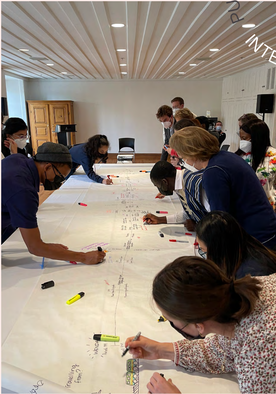
2021 Cohort, Quebec City, QC.